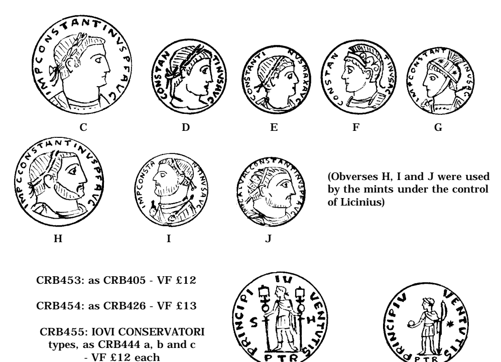
CRB456: - VF £24