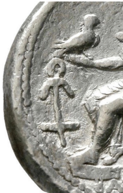
Figure 2. Enlargement: type 5.7 (Cat. No. 66) reverse left field.

The most notable outcome of the die study is the identification of type 5.7 (Cat. No. 66; Plate 2, 66), die linked to type 5.6 (Cat. Nos. 63-65; Plate 2, 63-64) with the same AI / Π mint marks, but struck from a reverse die (P34) on which an anchor (flukes up) was engraved over the incompletely erased wreath symbol. The leaves of the latter can be recognised beneath the extended right arm and hand of Zeus and immediately above and before his right knee (Figure 2).