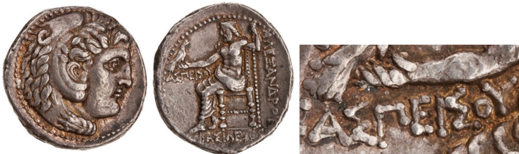
Figure 1. Aspeias tetradrachm (ANS 1944.100.72211).